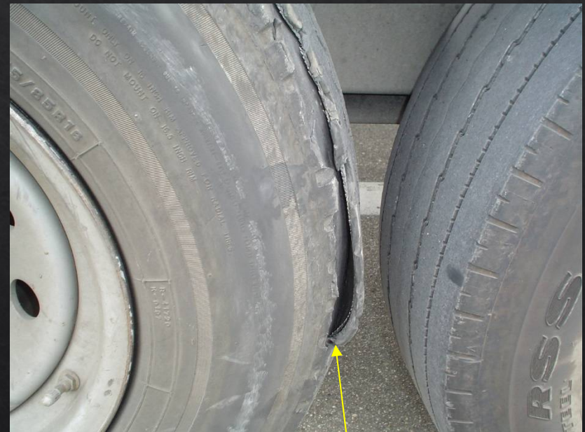
Tire Tread Separation