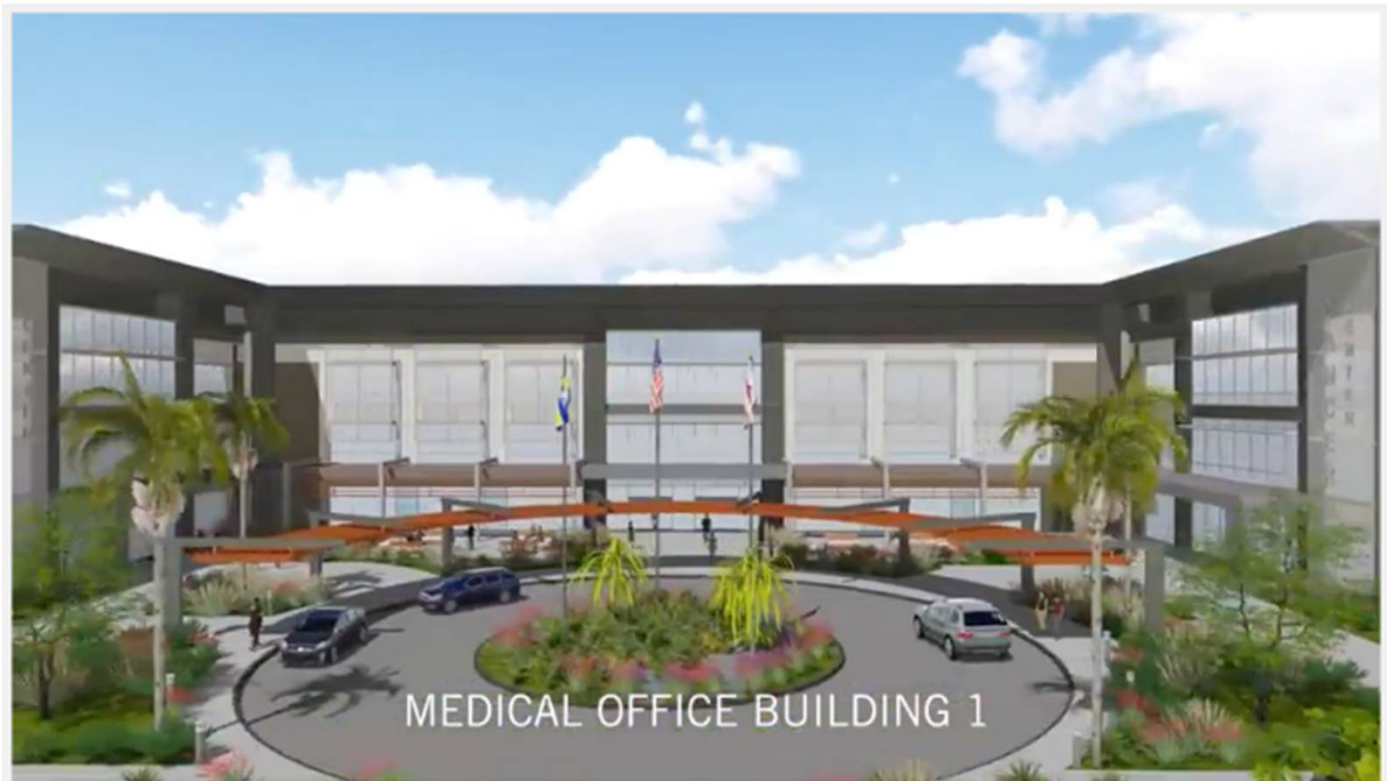
Screen shot of animation for proposed 180,000+ sq. ft. Medical Office Building 1