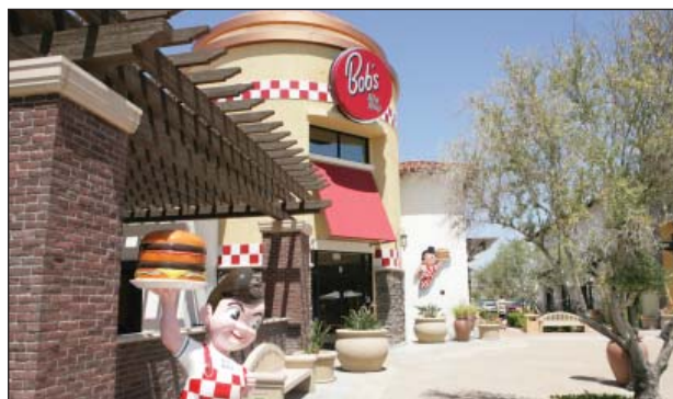
Eat Hot Fudge Cake locally -Bob's Big Boy joined the other offerings at Stoneridge Towne Centre. Eating and shopping in Moreno Valley helps support City services and programs.

Shopping locally is an Economic Stimulus Plan. Shop in Moreno Valley and be a part of improving quality of life and economics in the community. Shopping locally is just like making an investment- it provides short and long-term benefits to residents and businesses by building a healthy economic base and enhancing the City's quality of life. Shopping within the City helps local businesses and, as local merchants prosper, they provide much-needed jobs in our community. Desired products and services are made available locally, enhancing shopping opportunities for both residents and businesses.