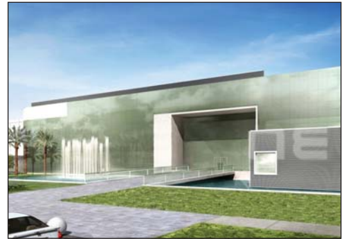
Skechers USA -Construction has begun on a Moreno Valley facility that will eventually employ 1,000 people.

The highly anticipated construction of the 1.8 million square foot distribution facility for Skechers USA, Inc. by Highland Fairview is underway. Grading on the 265-acre property was recently completed and building permits have been issued. The development is taking place on the south side of SR 60 between Redlands Boulevard and Theodore Street as part of an overall 2.6 million square foot mixed-use facility. Skechers' more than $200 million investment for the Moreno Valley facility will employ as many as 1,000 people during the construction phase and provide approximately 1,000 permanent jobs. Construction is expected to be complete in Spring 2011.