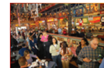
Portillo's Restaurant

The Economic Development section of the City's Web site was recently updated and provides more information than ever before. Go to www.moreno-valley.ca.us to look for current information on what's coming or what's under development in Moreno Valley. The Web site also provides access to a variety of resources available, including business support services, housing programs, redevelopment and much, much more.